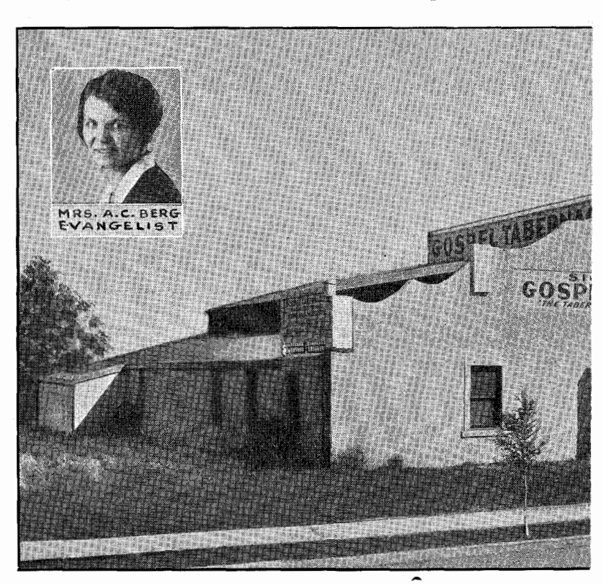
The Gospel Tabernacle of Sioux Falls, So. !

The Gospel Tabernacle is located in the very heart of the city. Sioux Falls has a Radio Station and for over six years the Tabernacle has been broadcasting the message of the Gospel to an ever-increasing radio audience. This is a very fruitful department of the work. Each week the mail brings letters from an appreciative audience telling of the help received in this way. Souls have been saved, the sick healed and some have even received the baptism of the